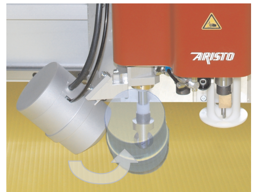
Software-driven change of direction of the light source.